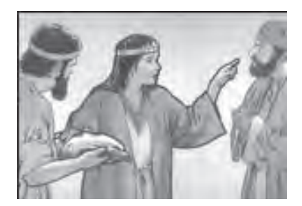
Children will enjoy role-playing the encounter between Hatach and Mordecai.

Hatach didn't stop to ask any questions.