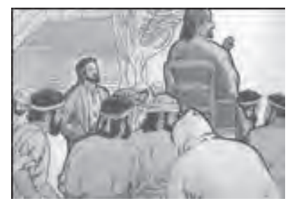
Children would enjoy acting out this part of the story.

Show card with application for the saved child: "You should obey God and be known as a Christian, even when it is difficult to do so".