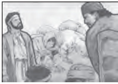
Read (or have an older child read) the verse from your Bible.