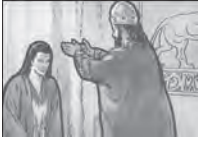
You may wish to make a crown and show it at this point.

Bring a robe or shawl for the children to dress up like Esther going before the king.